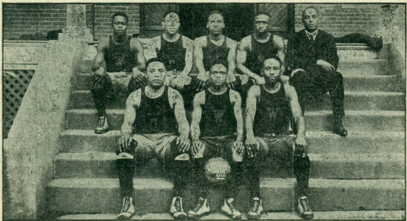
THE VARSITY BASKETBALL TEAM OF 1919-20