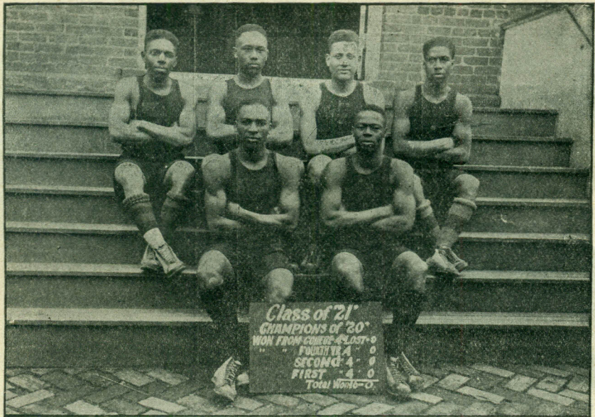
CLASS BASKETBALL CHAMPIONS OF 1919