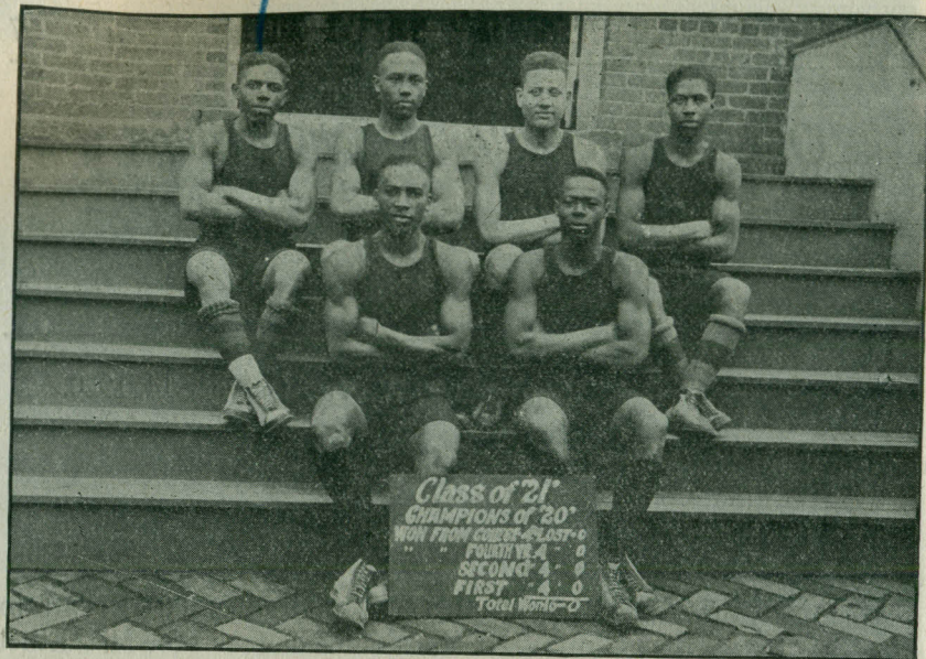
CLASS BASKETBALL CHAMPIONS OF 1919