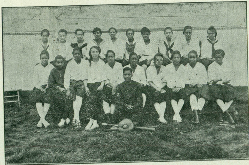
BASEBALL FOR THE GIRLS