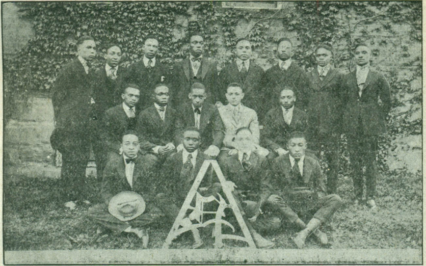
THE PLATONIAN CLUB

rons, brought their boys from Madison, W. Va. and placed them in school.